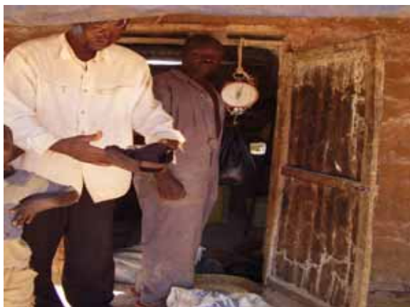
The Camp is Best for Business, Alokolum Ongako sub-county

Some people who run small businesses at the camp will not move completely. They tend to commute between the sites and camp to develop and secure their businesses. And yet others have bought land and other valuable items that they feel secure with in the camp than in the return sites.